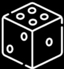
AFTER DINNER GAMES