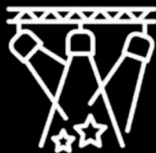
FUTURISTIC LIGHTING RIG