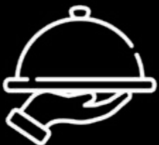
THREE COURSE DINNER