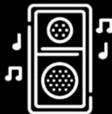
STATE OF THE ART SOUND SYSTEM