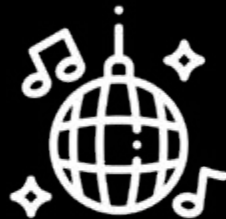
DJ & DISCO